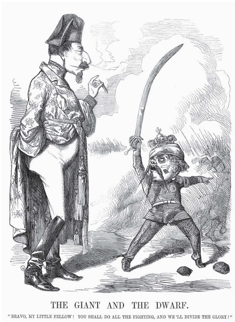
A British cartoon published in June 1859. It shows Napoleon III and Victor Emmanuel during the Battle of Magenta.