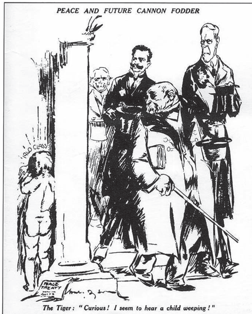
A cartoon published in a British newspaper, 13 May 1919.